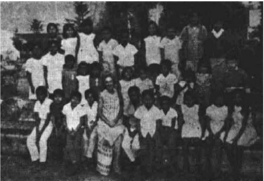
A group of raw-vegan children at the Nancy Anna Zabler orphanage in Australia