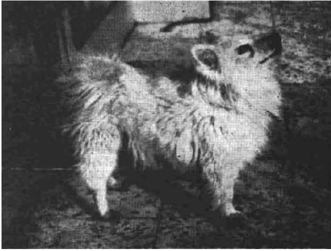
Beautiful 7 years-old white dog, Jackie lives with us as a raw vegan from the first of his life.

Now it is easily proven that meat eating is unnatural even for other animals, and we don't have real carnivores. Jackie has been accustomed to the food we eat since birth. Most of his food consists of wheat, dates, raisins, pistachios, salads and various fruits, all of these in live (raw) form, because in our house there is not even a single gram of dead food. This dog even eats onions and radish with great desire. When we take him outside the city, he grazes like a lamb in the green meadows. Compared to other dogs, this dog is extremely healthy, fresh and full of energy. If we want to accustom the cubs of lions, leopards and wolves to eat plants like this dog, after a few generations they will completely abandon their ferocity and become calm, and they can live together with other animals such as cows. But on the contrary, we can never get cows used to eating meat.